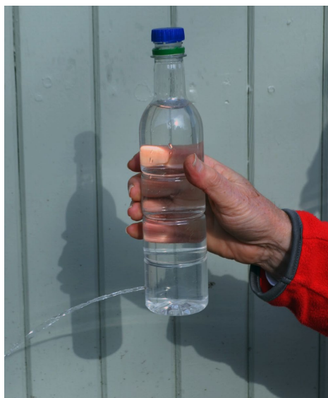
Figure 4: Holding the bottle with a hole at the base: a jet of water flows out.

If you fill the bottle with water and hold it with the cap unscrewed for a few seconds (figure 4), the water will flow out of the hole.