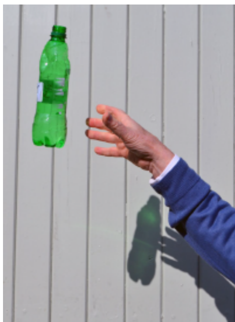
Figure 5: Full bottle with hole thrown in the air, in free fall. Why is no water coming out?

Now throw the bottle up in the air (figure 5), and watch it carefully as it falls. Observe each part of its journey – on the way up, at the top of its flight, and on the way down.