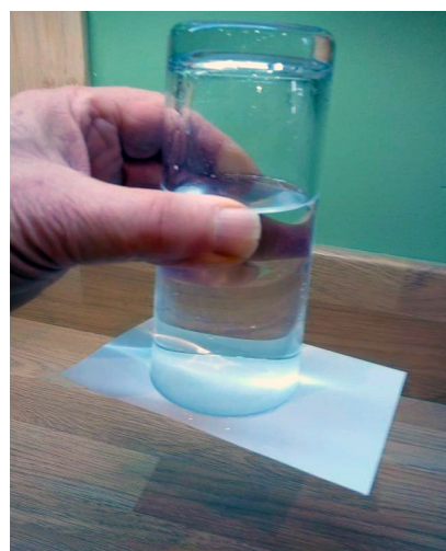
Figure 1: Glass of water turned upside down. Why does the card stay in place?