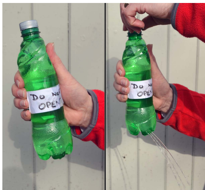
Figure 3: A bottle full of water, with holes near the bottom. What happens if you ignore the warning?