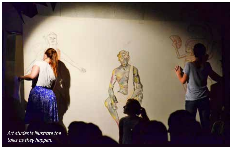
Art students illustrate the talks as they happen.

One month before the event, we hold a workshop for all the student candidates, which is run by our drama teacher. This helps them with their presentation skills (e.g. articulation, body language, stage presence, use of space) and