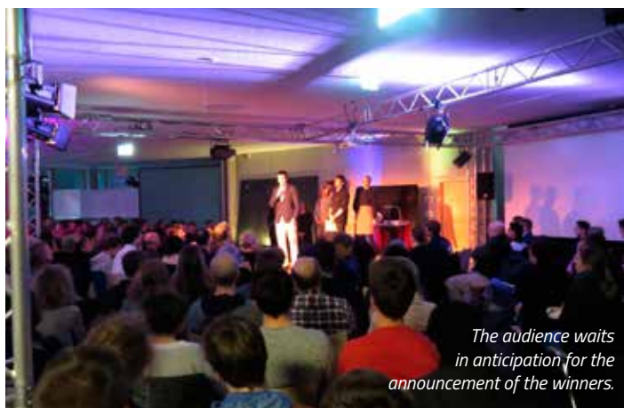
The audience waits in anticipation for the announcement of the winners.