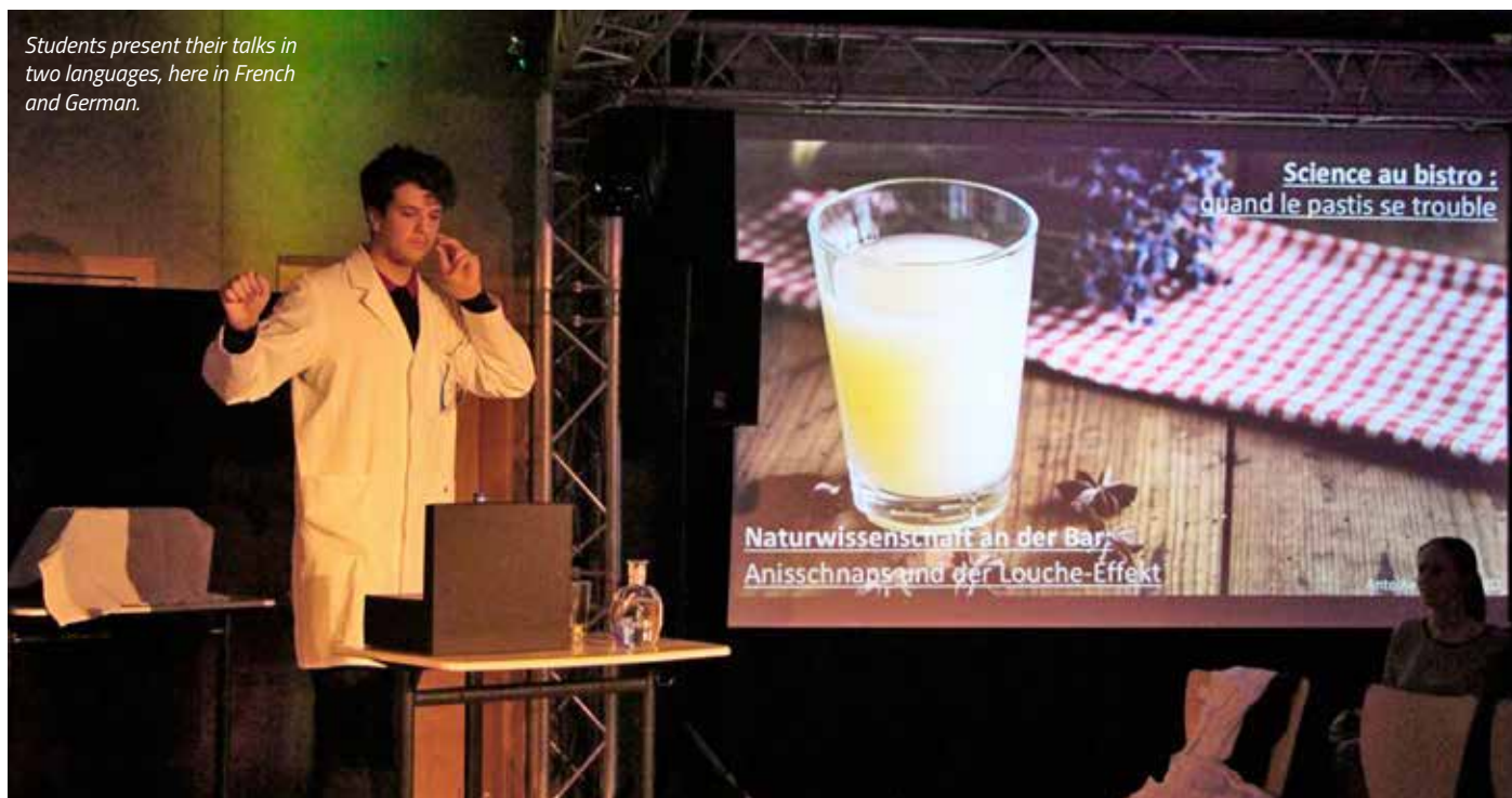
Students present their talks in two languages, here in French and German.