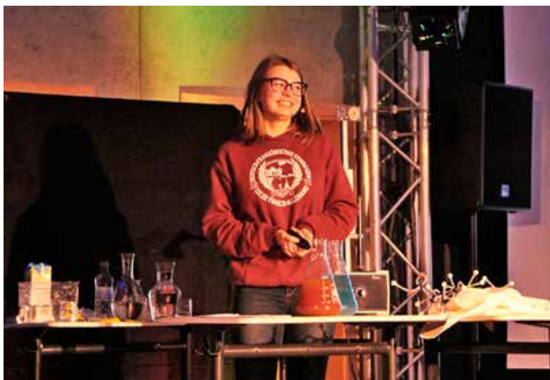
Colourful chemical reactions add extra excitement to this student's talk.