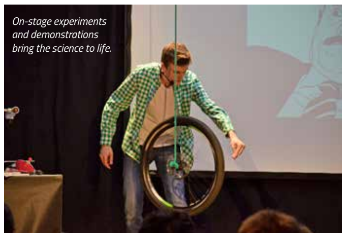
On-stage experiments and demonstrations bring the science to life.