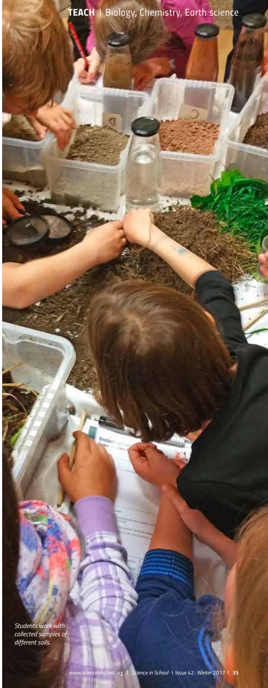
Students work with collected samples of different soils.