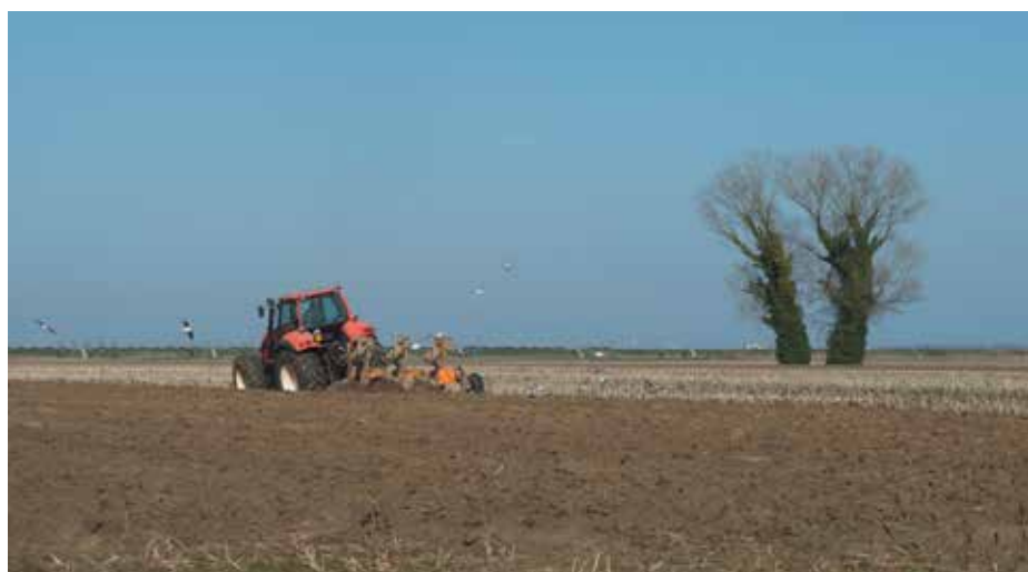
Turning the soil during ploughing reduces the organic matter, which can lead to weaker soil structure and eventually to erosion.