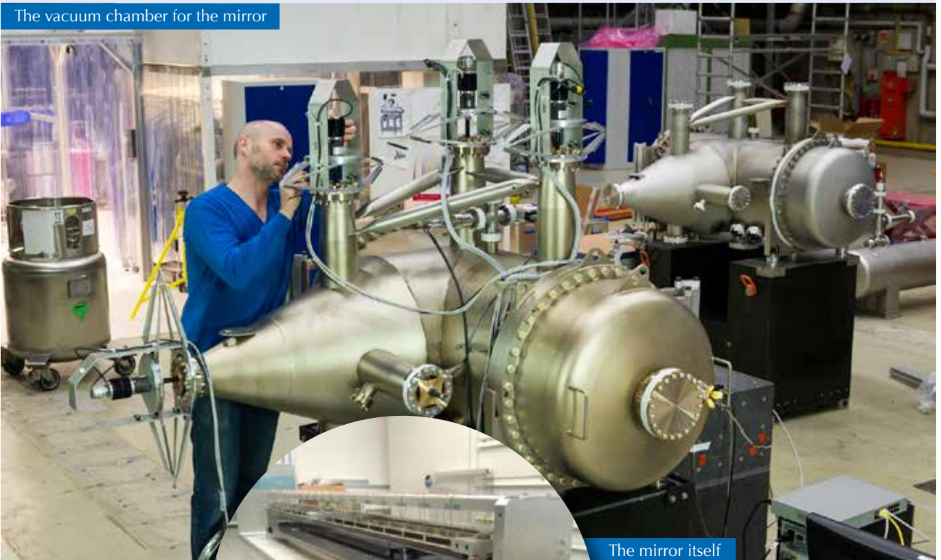
The mirror itself