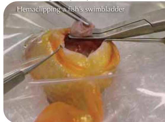
Hemaclipping a fish's swimbladder