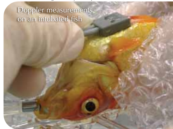
Doppler measurements on an intubated fish