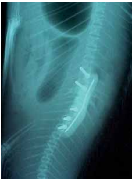
Radiography of a fish with a broken back that has been fixed with plates and screws

Of course, good science writing implies not only finding good stories but also writing them well. In Rebecca's words: "To me, good science writing is really just good writing that happens to be about a scientific topic. At the basic story level there is no difference." So, she says, you need the same basic ingredients in science writing as in any kind of storytelling: characters, scenes, actions and a plot. You need a narra-