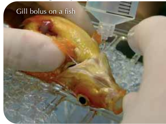
Gill bolus on a fish